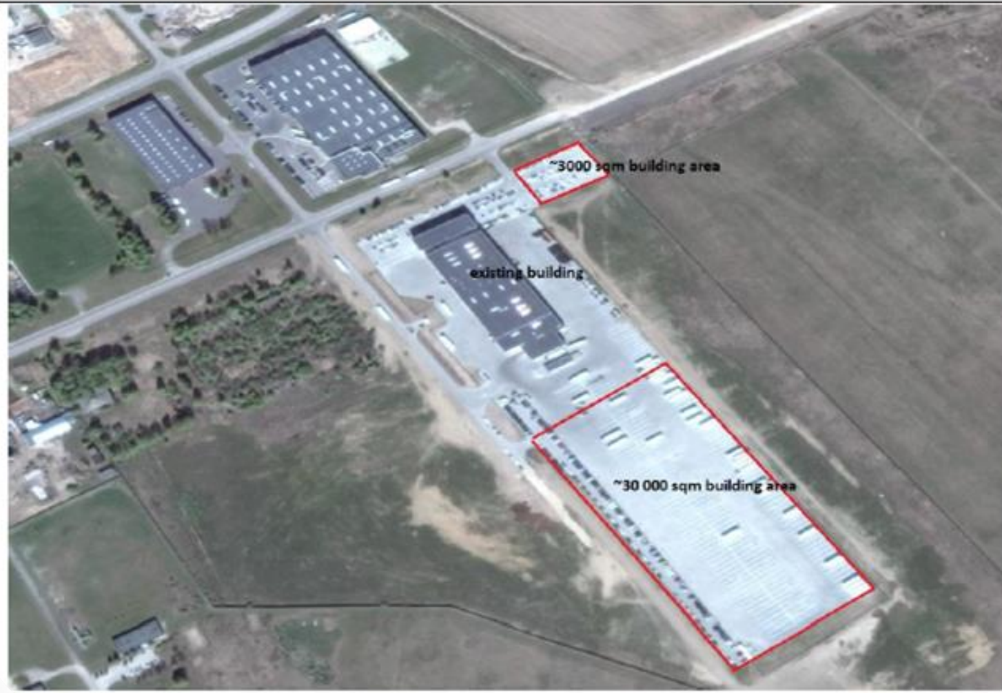
Building location in territory